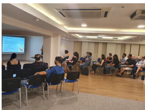
CYPRUS - 26th of June, 2019 Organizers: GrantXpert Consulting and Institute of Development N. Charalambous