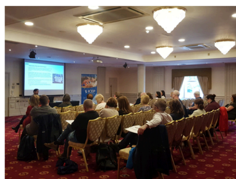
IRELAND- 28th of May, 2019 Organizers: ICEP Europe