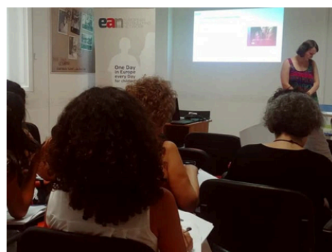
ITALY- 10th of July, 2019 Organizers: CESIE